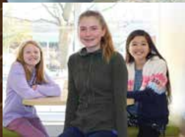
Highcrest Learning Commons Completed; All D39 Students Have Access to a State-of-the-Art Learning Center

In February 2020, Wilmette Public Schools celebrated the completion of a $3.4 million renovation of the learning commons at Highcrest Middle School. The renovation includes a 3,310 sq. ft addition, digital and creative learning spaces, partitionable small group work spaces and indoor/outdoor classroom space. The completion of the Highcrest Learning Commons marks the culmination of a five-year strategic initiative to renovate library and technology spaces in each school building. Each District 39 building now includes a modern library technology center equipped with spaces designed to promote collaboration, creativity, creativity and critical thinking.